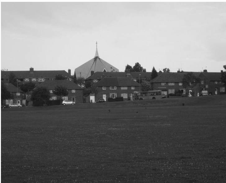
Hoblingwell Wood, pictured above, is in danger of becoming a landfill site

Please do get in touch with us to express your views on this project and if you would consider joining a Friends group to protect and improve Hoblingwell Wood. You can return the slip on the other side of this leaflet, to the Freepost address. We will keep residents informed of any developments on this important issue.